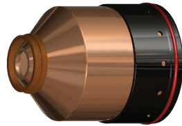
Nozzle Retaining Cap 90-0755 - H35 90-0756 - N 2