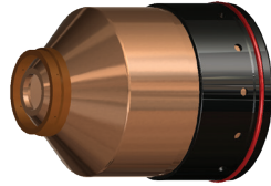
Nozzle Retaining Cap 90-0755